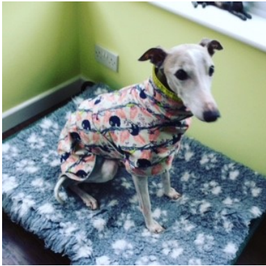
She has also made a lightweight Spring coat for her dog. Very smart!