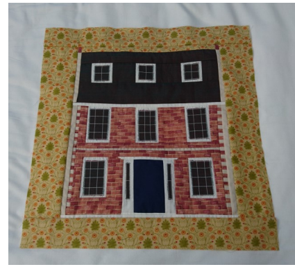
This is the central block for a quilt which was quite a mathematical challenge to get the proportions correct . I was helped by a free pattern for the Red House quilt which I downloaded from the Quilters Guild.