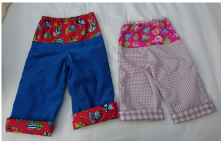
Reversible trousers for two of the grandchildren.