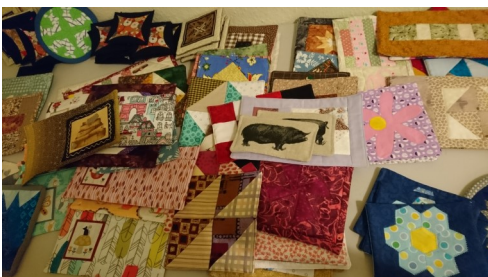
Mug Rugs donated for the tombola.

Our 20th Anniversary Exhibition will be held at Park House School on 23rd—25th October 2020.