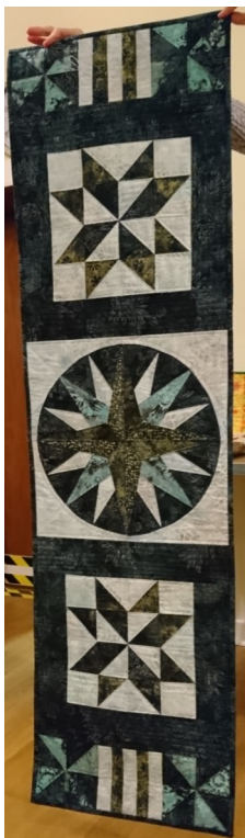
Pat Br brought a table runner using a variety of blocks