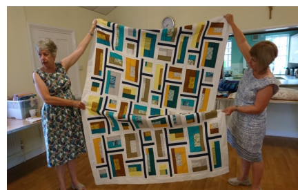
The Raffle Quilt

We will need a lot of cheerful mug mats so please think of this when you are wondering what to do with your scraps over the next few months.