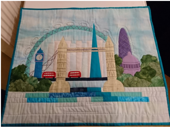
One of a series of cityscapes by Gail.