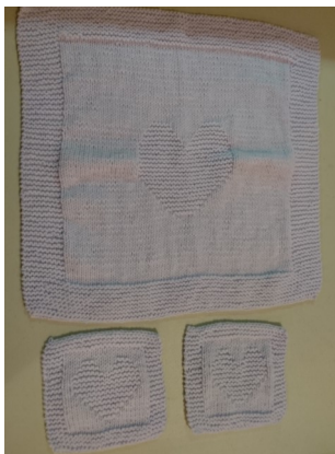
a small blanket along with two bonding squares, one for the baby and one for the Mother so that they each have the others scent when they are separated in the special care unit.