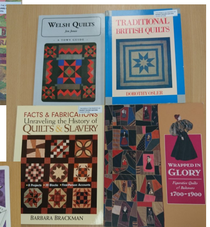
History books and novels