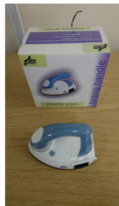
A mini iron