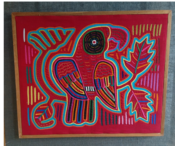
San Blas applique from Central America