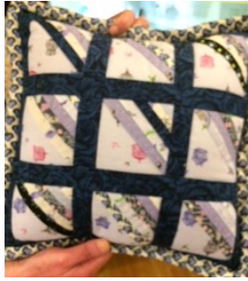
A strippy cushion by Sandra H