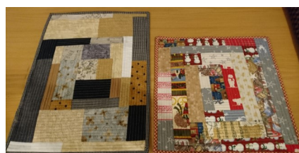
Two placemats by Sandra K—one day she will make a set!