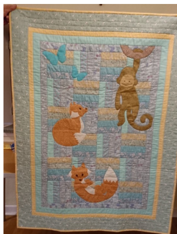
Val's quilt for the grandchild she is waiting for any day....