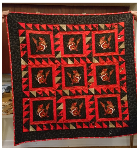
Also a striking dragon quilt by Cat.