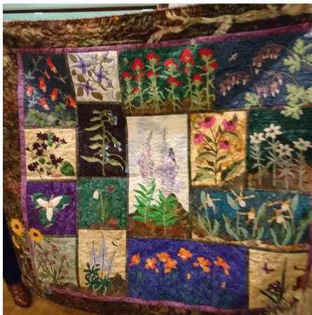
An example of a Quilt as you Go machine appliqued quilt by Cat.