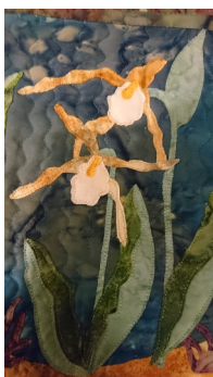
A detail from the quilt.