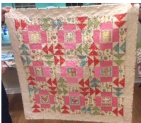
A modern quilt made by Cat and a rug which I know that she only bought the pattern for at the Club Day so she has been as busy as ever!