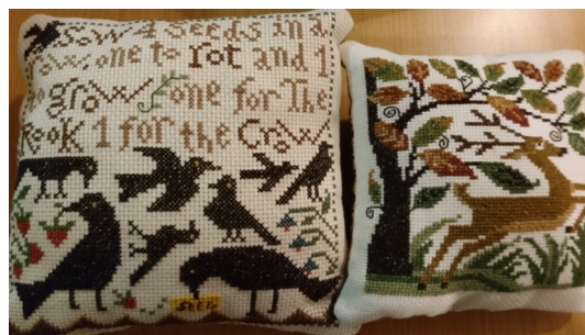
Two small cross stitch cushions by Jacqui.