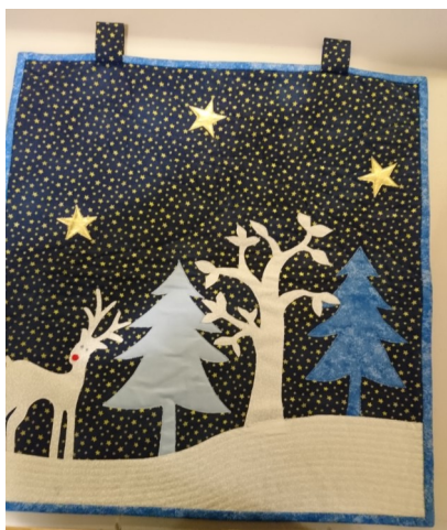
A wallhanging from Sue D;