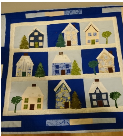
Winter Houses from June;