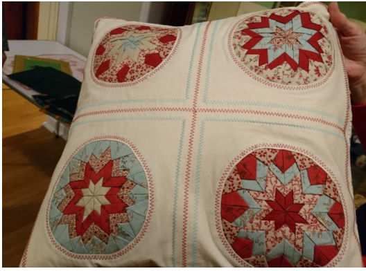
Linda showed a Somerset Patchwork cushion also made at a recent workshop. The fabric is folded which gives a feel almost of origami and produces a very accurate design.