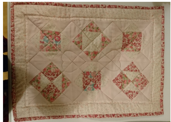
Please keep the premmie quilts coming in if you can so that we can give a good donation to Basingstoke in the Spring.