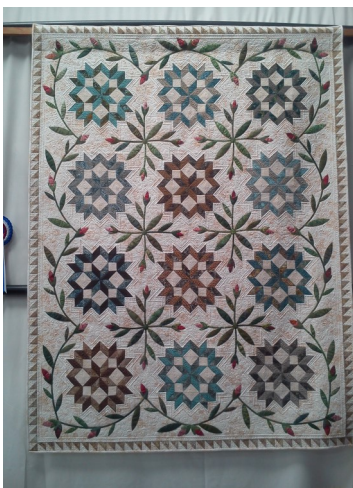
A lovely design