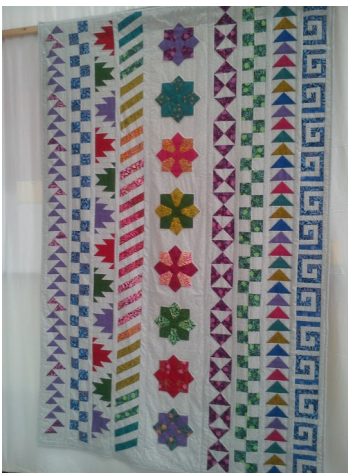
A modern strippy