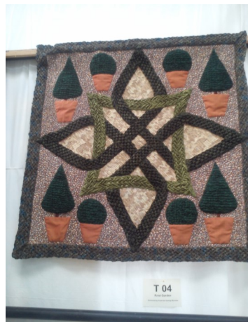
Smocking used for texture