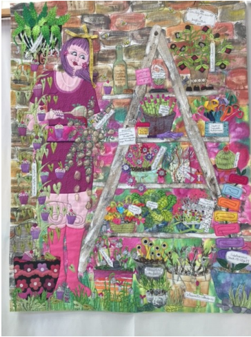
The winning quilt