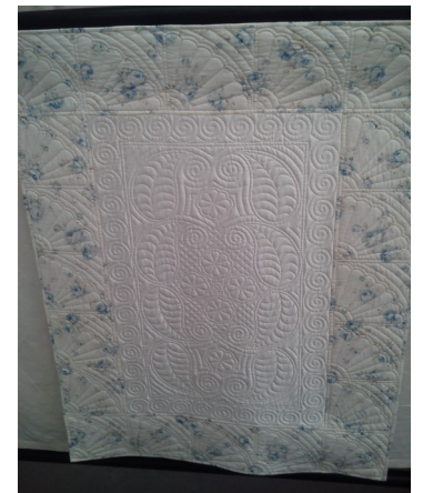
Adding an extension to a cot quilt ?