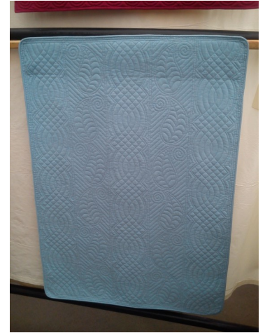
Curves running in to squares