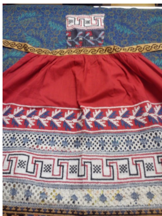
Russian embroidered costume.

There will be a sign up sheet and a list of food items at the September and October meetings.